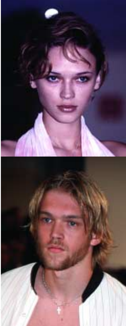
Look for updos, bangs and big hair this spring-all a little windblown.